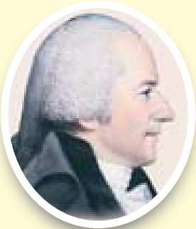
ALEXANDER HAMILTON 1755–1804

Born into poverty in the British West Indies, Alexander Hamilton was orphaned at age 13 and went to work as a shipping clerk. He later made his way to New York, where he attended King's College (now Columbia University). He joined the army during the Revolution and became an aide to General Washington. Intensely ambitious, Hamilton quickly moved up in society. Although in his humble origins Hamilton was the opposite of Jefferson, he had little faith in the common citizen and sided with the interests of upper-class Americans. Hamilton said of Jefferson's beloved common people: "Your people, sir, your people is a great beast!"