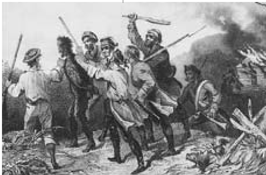
◀ A group of rebels taking part in the Whiskey Rebellion tar and feather a tax collector.

Most whiskey producers were small frontier farmers. Their major crop was corn. Corn was too bulky to carry across the Appalachian Mountains and sell in the settled areas along the Atlantic. Therefore, the farmers distilled the corn into whiskey, which could be more easily sent to market on the backs of mules.