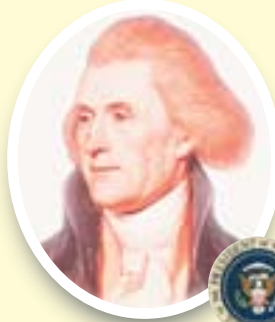
THOMAS JEFFERSON 1743–1826

Born into poverty in the British West Indies, Alexander Hamilton was orphaned at age 13 and went to work as a shipping clerk. He later made his way to New York, where he attended King's College (now Columbia University). He joined the army during the Revolution and became an aide to General Washington. Intensely ambitious, Hamilton quickly moved up in society. Although in his humble origins Hamilton was the opposite of Jefferson, he had little faith in the common citizen and sided with the interests of upper-class Americans. Hamilton said of Jefferson's beloved common people: "Your people, sir, your people is a great beast!"